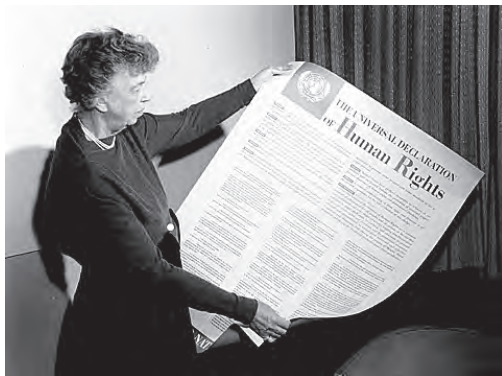
Eleanor Roosevelt with the Universal Declaration of Human Rights.

There are those who would argue that healthcare is a commodity that is bought and sold. In that framework, those who are in an economic position to buy healthcare get the medical attention they need. Those who are unable to pay go without basic medical care. This is the dominant framework in the current debate over our current healthcare system.