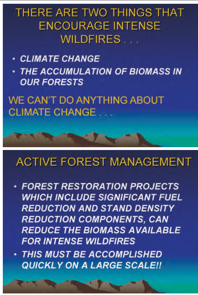
The Big Sky Coalition's website features Power Point slides from the Ravalli County Off-Road Users. The presentation claims that nothing can be done about climate change, and that the solution lies in large-scale logging projects.

While Dubrasich doesn't live in the Bitterroot Valley, he is a vocal sup- (Bitterroot, cont. on page 9)