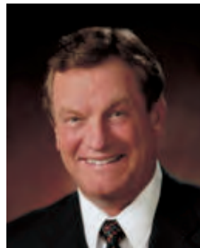
U.S. Rep. Mike Simpson (R-ID)

One of the first public actions taken by the Equality Project was condemning an anti-gay “joke” between U.S. Representatives Rehberg and Simpson.