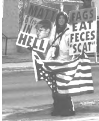
(Left) Protestor in front of the Montana Supreme Court. (Right) Protestor in front of First Presbyterian Church.