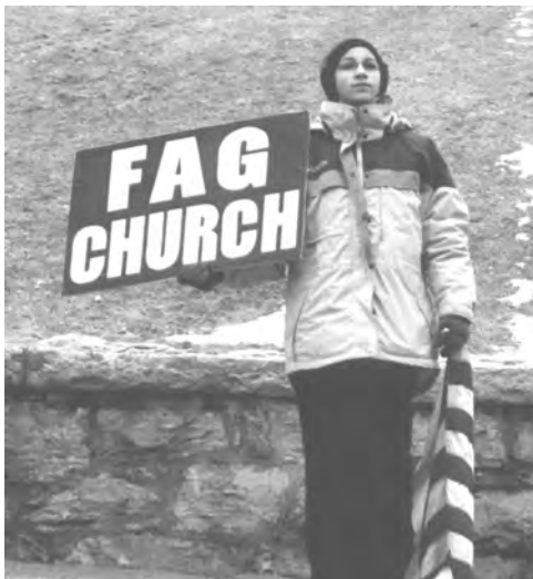
(Left and below) Following their appearance at the Cathedral, Phelps' crew moved down the street to St. Paul's United Methodist Church.