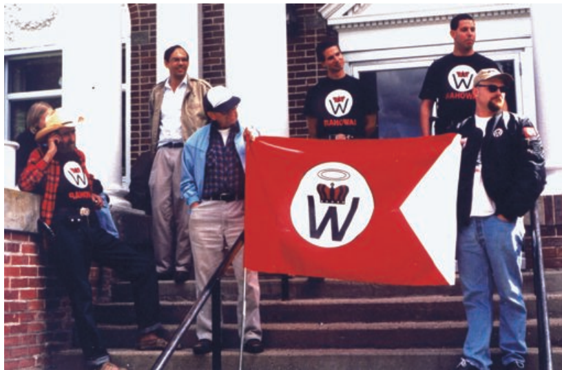
The Creativity Movement frequently held its annual meetings in Superior, Montana, during the mid-1990s. They would stage demonstrations in town, including on the steps of the Mineral County Courthouse.

A common conspiracy driving white-supremacist ideology views Jews as global power brokers out to destroy the white race, and their main tools are people of color, who are viewed as sub-human beasts or "mud people." It is the combination of racism and anti-Semitism that drives the white supremacist movement. Klassen claimed that the "Jewish race" was "working towards the niggerization of America." He stated "Jewish poison-peddlers" promote tolerance and equality in an effort to turn America into a "slop pail only fit for pigs and niggers." He summed up his group's view of the dynamic between Jews and people of color like this: